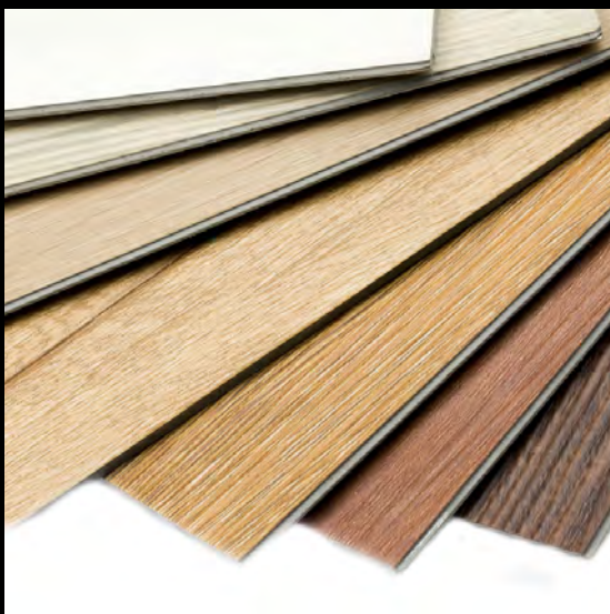
HARDWOOD PARQUET FLOORING