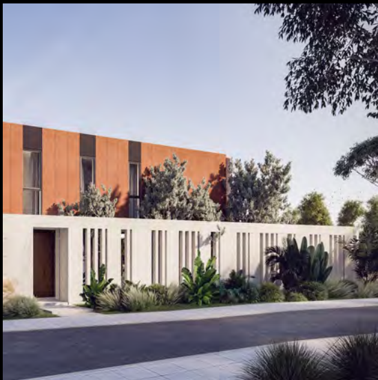
UNRIVALLED CONSTRUCTION QUALITY