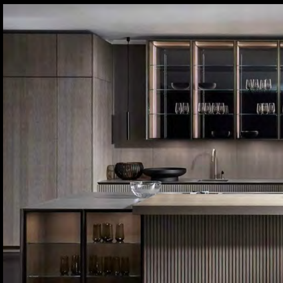
LUXURY GERMAN KITCHENS BY EGGERSMANN