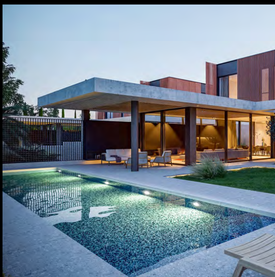
OVER-FLOW SWIMMING POOL