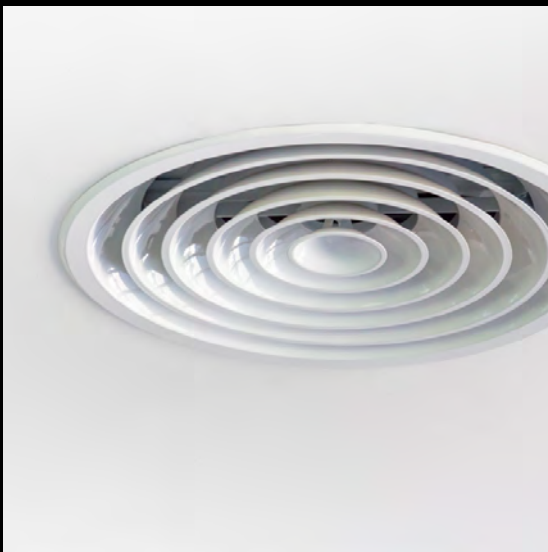
FULL AIR-CONDITIONING INSTALLATION