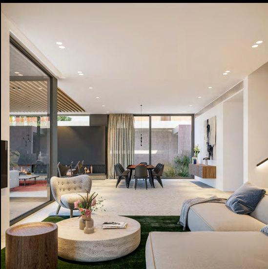
UNDERFLOOR CENTRAL HEATING WITH HEAT-PUMP