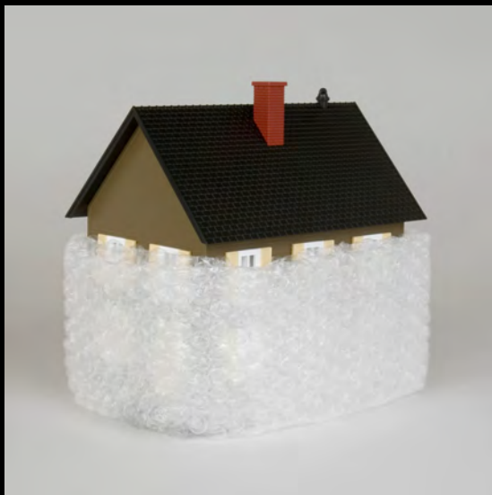
'A' HIGHEST THERMAL EFFICIENCY RATING